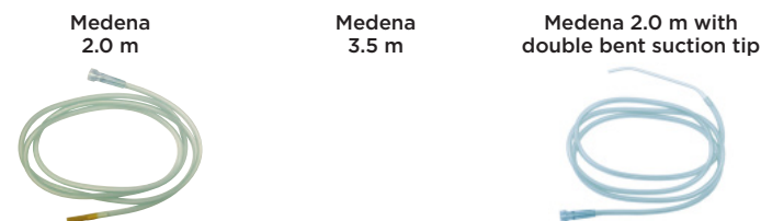
Medena 2.0 m