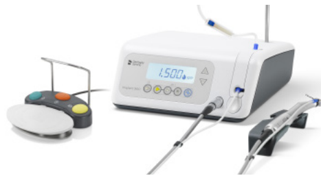
Implant 900 Set SI-923, 230V